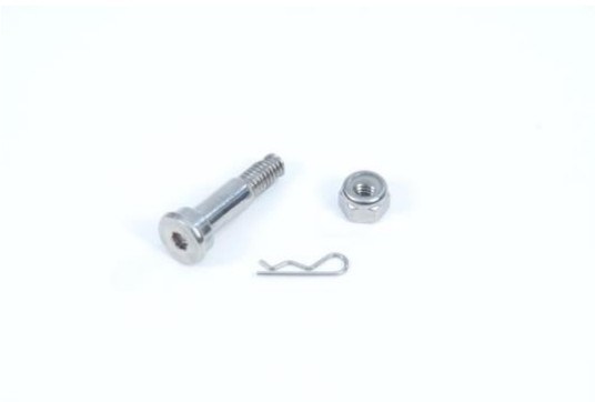
Figure 2 – Fixings

Fixings used to hold the ramp together, if you wish to reduce the ramp length you will need to use the allen key and wrench to unscrew the parts and remove a section.