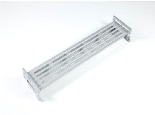
Figure 3 – Ramp Section

The ramps are made up of various sections, each section is circa 13cm by your chosen width. If you wish to reduce the ramp length you can use the allen key and spanner to remove these sections. Additional sections can also be purchased if you wish to extend your ramp length.