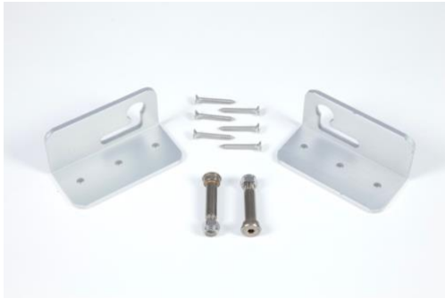
Figure 7 - Fixing Plate and screws

Fixing plates are available for those who wish to secure the ramp to the step. This is an additional purchase and not included with the ramp.