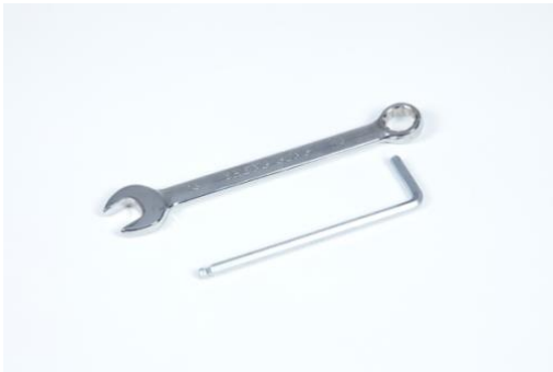
Figure 1 – Allan Key and Wrench

Allan key and wrench is provided with all ramps to allow you to add or remove sections when required