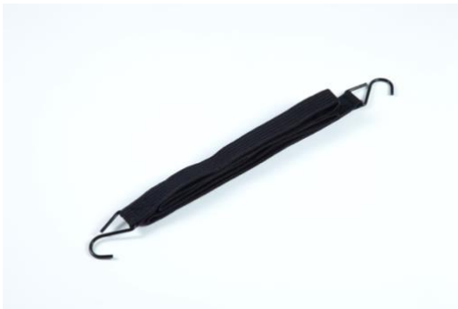
Figure 5 - Black Strap

A black strap is provided with all ramps and we recommend using this when the ramp is stored. To use simply roll the ramp up and place this around the ramp. Clip the black strap around the ramp to hold it shut.